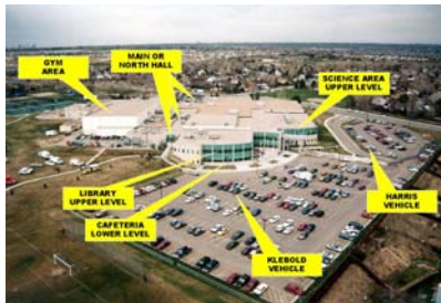
Columbine High School April 20, 1999

BIT Consultants, LLC is pleased to be able to offer customized training in a variety of subjects to include our suite of global solutions for threat management. Today's world is characterized by ever changing threats to individuals and to institutions. Businesses of all kinds, such as schools, malls, chemical plants, and office buildings, have seen incidents of violence occur on their facilities. Acts of violence continue to increase in other areas such as our courts, airports, factories, and numerous other facilities. We can enhance your employees' safety during incidents of violence by training them on what to do and why. BIT Consultants can give them the specialized training they need to overcome confusion and fear, which can keep them from acting in critical situations. Receptionists, customer service, and human resources personnel are among those on the front line when it comes to contact with the public. The training we give will not only increase their survivability during acts of violence, but will help minimize your company's potential exposure to civil liability torts and worker's compensation claims. We will teach them how to develop the "Critical Mindset" ® necessary to face an adversary and make vital choices for themselves and others.